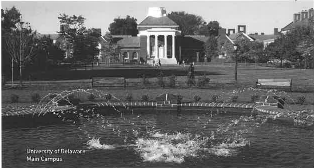
University of Delaware Main Campus

THE UNIVERSITY OF DELAWARE has grown from its founding as a small private academy in 1743 to a major university. The University offers an impressive collection of educational resources. The 16,000 undergraduate students may choose to major in any one or more of over 100 academic majors. The University's distinguished faculty includes internationally known scientists, authors and teachers, who are committed to continuing the University of Delaware's tradition in providing one of the highest quality undergraduate educations available in the United States.