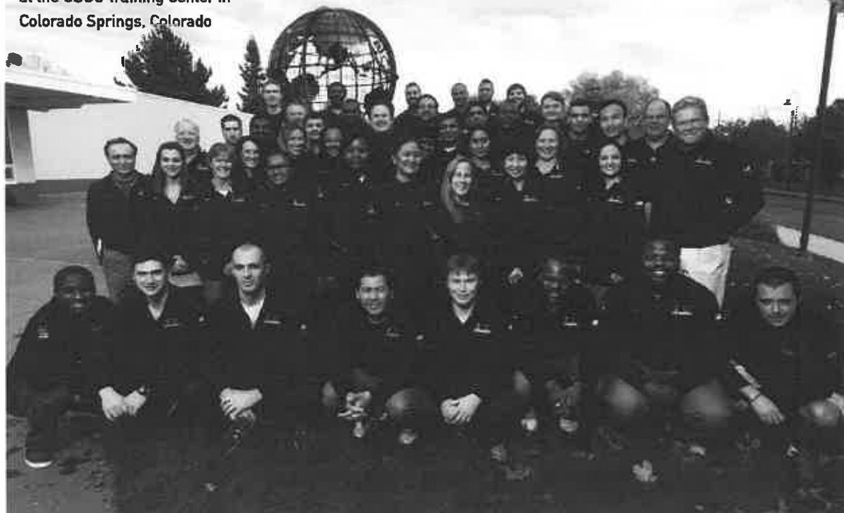
Eighth-year ICECP participants at the USOC Training Center in Colorado Springs, Colorado

"This is a very high classed coaching course taking into consideration its content and intensity, great idea to keep, there should be a follow up of past participants after they pass through this program for an international network. There should be a physical exercise by all coaches as a group twice a week, a proper tour of the gym because some of us saw certain machines for the first time. Thanks for all the great work!"