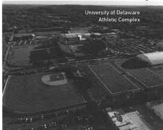
University of Delaware Athletic Complex

Visit www.udel.edu to learn more about the University.